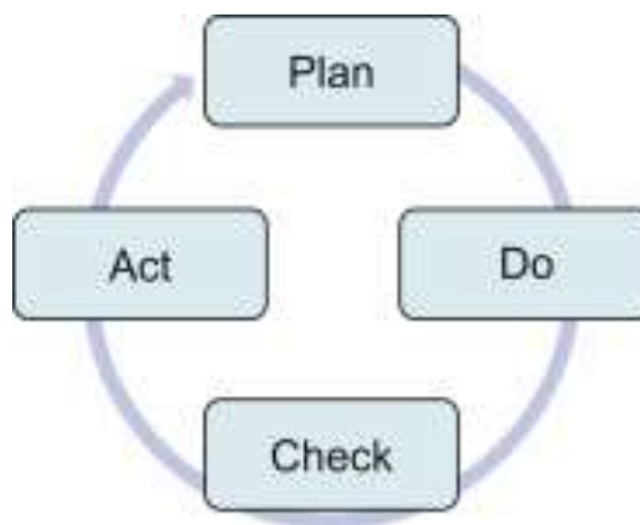
Figure 1. Plan, Do, Check, Act (PDCA) Cycle 7