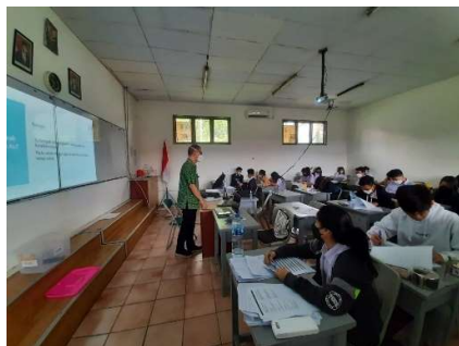
Figure 2. Documentation of Activities at SMA Kalam Kudus II Jakarta

Compared to the Pre-test, which was administered prior to the presenter's explanation of the material, there was an increase in knowledge on the Post-test. Therefore, it can be concluded that participants gained knowledge from this activity's material and discussions, particularly in regards to the skincare material presented.