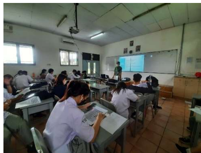
Figure 3. Documentation of Pre-Post Test Activities