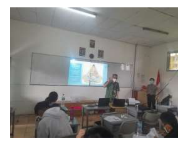
Figure 1. Documentation of Extension Activities at SMA Kalam Kudus II Jakarta

The enthusiasm of the participants in this activity was seen in the discussion and question and answer sessions that were conducted. This is illustrated by the increase in scores from the pre and post tests (Table 1). At the end of the event, the participants of this activity were committed to implementing clean and healthy living behaviors and becoming pioneers in society.