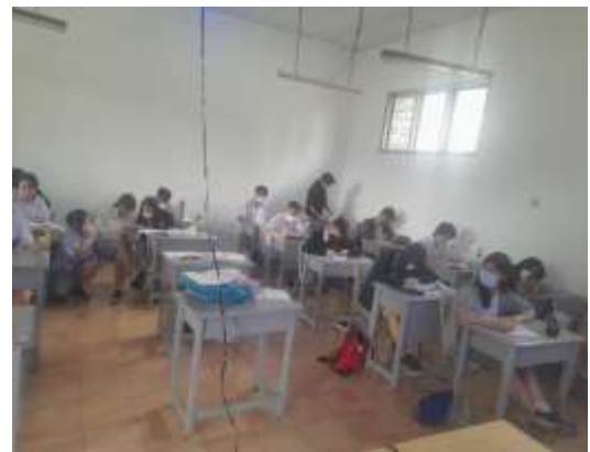
Figure 2. Documentation of Pre-Post Test Activities