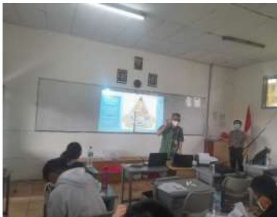
Figure 1. Documentation of Extension Activities at SMA Kalam Kudus II Jakarta

The enthusiasm of the participants in this activity was seen in the discussion and question and answer sessions that were conducted. This is illustrated by the increase in scores from the pre and post tests (Table 1). At the end of the event, the participants of this activity were committed to implementing clean and healthy living behaviors and becoming pioneers in society.