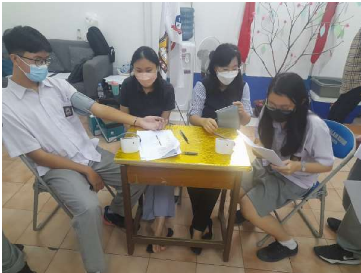
Figure 3. Questionnaire Filling Activity Process