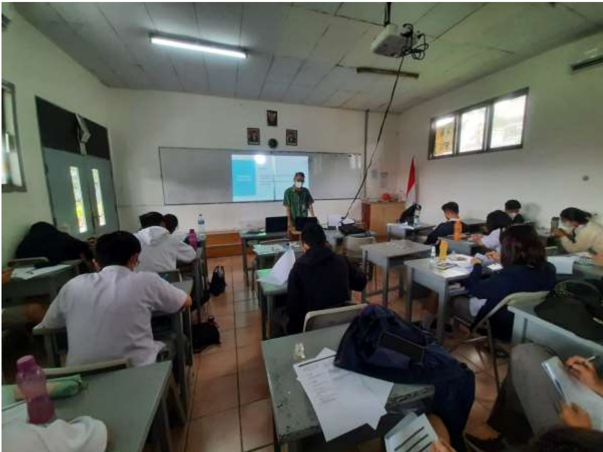
Figure 2. Counseling Process for Adolescents