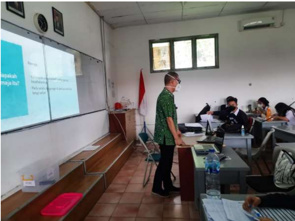
Figure 2. Counseling Process for Students of Kalam Kudus II Senior High School Jakarta