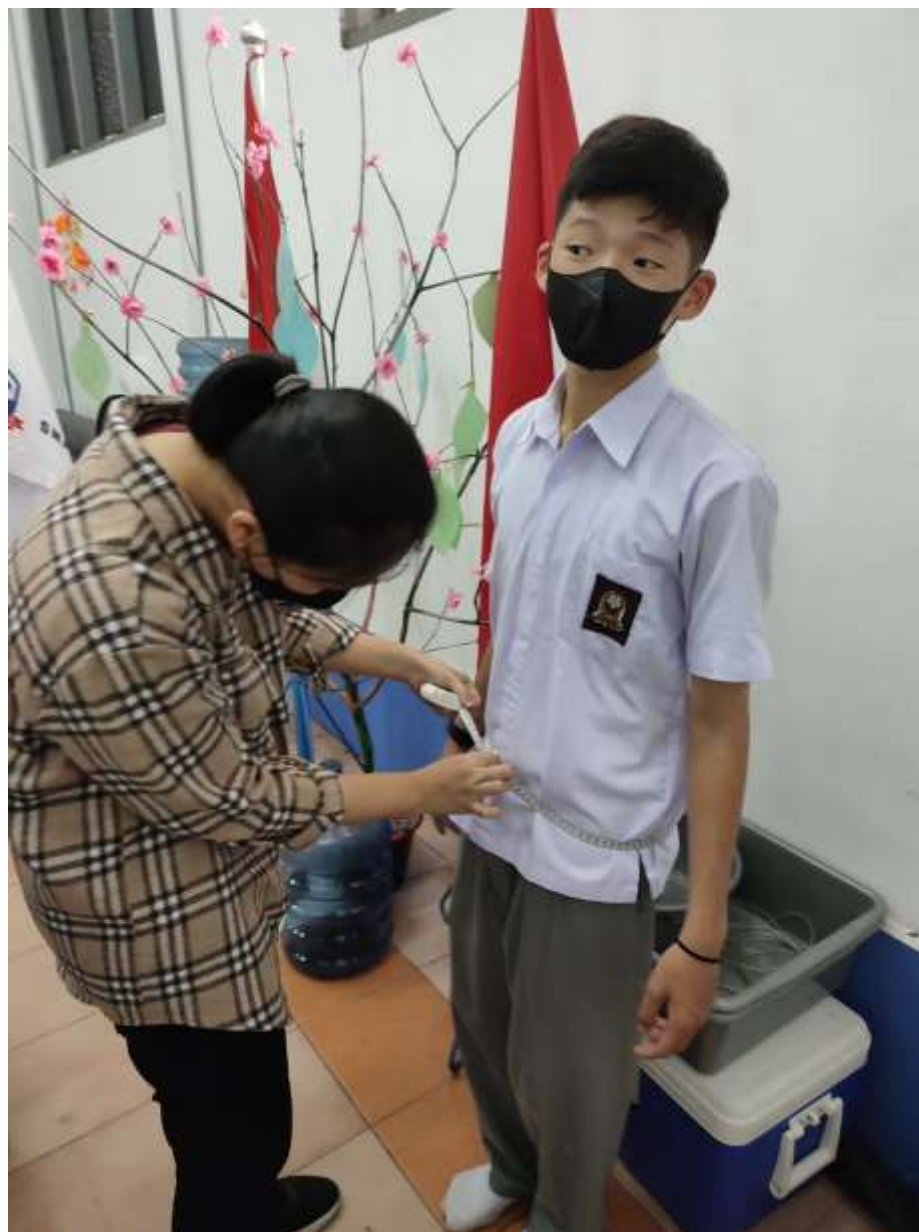
Figure 3. Process of Examination of Waist Circumference in Adolescents