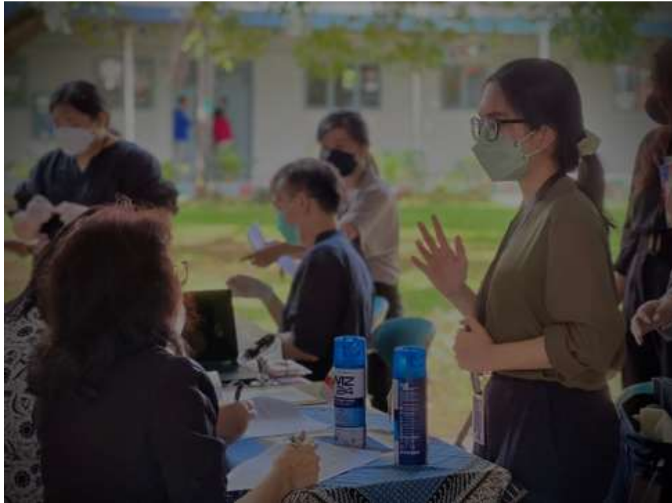
Figure 3. Individual counseling as a follow-up to examination results