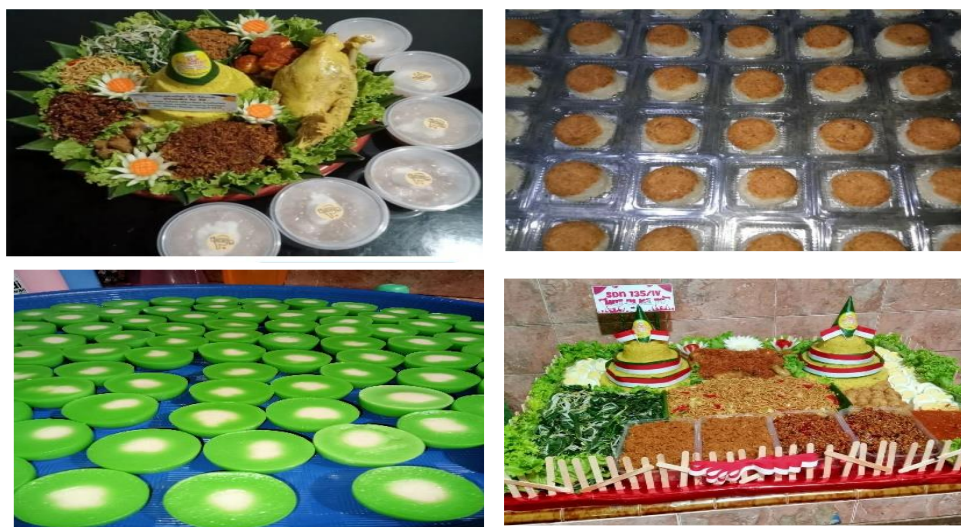
Figure 1. RVA Kitchen's Products

requests. In addition to tumpeng rice, the business also sells traditional cakes, boxed rice, mini tumpeng, chips, and cookies for Lebaran. Here is a picture of the partner's product: