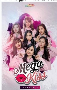
Figure 1 Megakiss Season Two