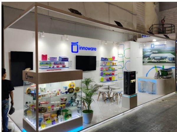
Booth PT. Innoware Indonesia