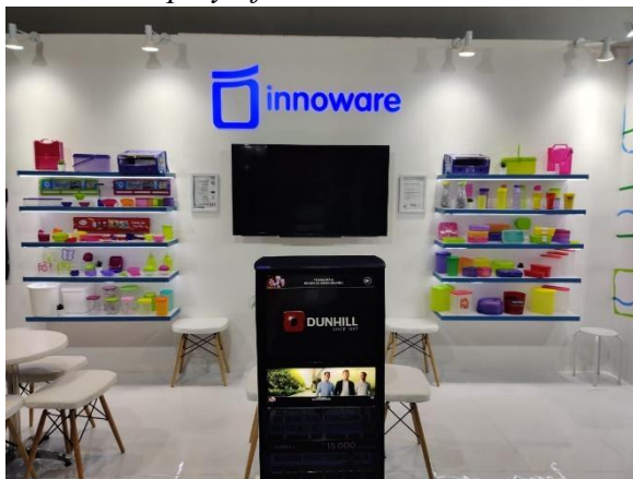
Product Display of PT. Innoware Indonesia