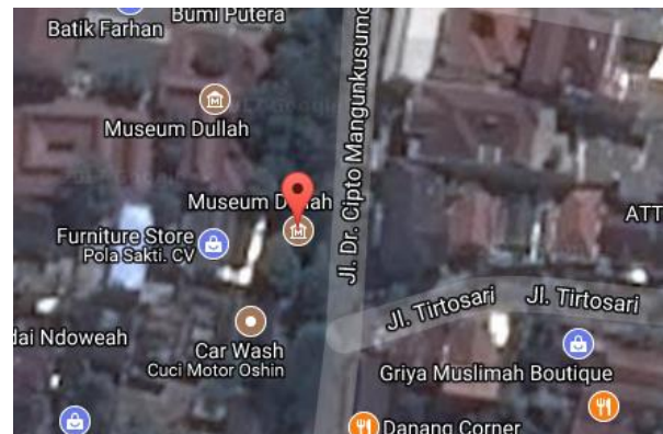
Figure 3: Visualization on maps