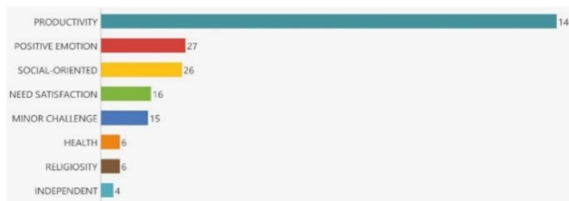
Figure 1. Distribution of adolescents' perception responses on subjective well-being

The perspective of the participants regarding subjective well-being is explained, followed by manifestations or forms of application of subjective well-being in daily activities. For the first question, WordCloud detected a frequent use of the word "productive". This is then followed by analysis at the next sentence level so that it is grouped into productive themes, and so on. After analysis, the coding is categorized into theme groups. Based on the eight themes of events that determine the well-being of the research subject, it was found that the most commonly perceived subjective well-being was the feeling that the self was productive. The following chart summarizes the frequency of events that illustrate adolescents' perceptions of the concept of well-being.