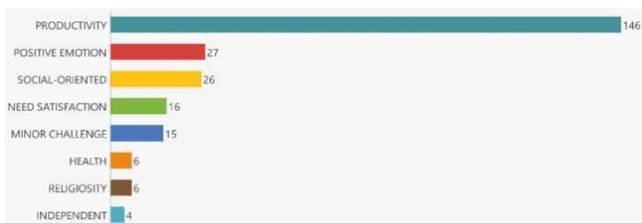
Figure 1. Distribution of adolescents' perception responses on subjective well-being

The perspective of the participants regarding subjective well-being is explained, followed by manifestations or forms of application of subjective well-being in daily activities. For the first question, WordCloud detected a frequent use of the word "productive". This is then followed by analysis at the next sentence level so that it is grouped into productive themes, and so on. After analysis, the coding is categorized into theme groups. Based on the eight themes of events that determine the well-being of the research subject, it was found that the most commonly perceived subjective well-being was the feeling that the self was productive. The following chart summarizes the frequency of events that illustrate adolescents' perceptions of the concept of well-being.