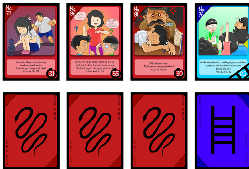
Figure 4: Pancasila snakes and ladders Cards