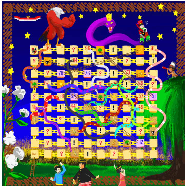
Figure 3: Pancasila snakes and ladders boardgame (60x60 cm)