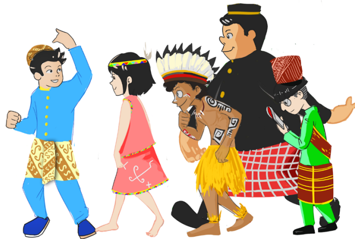
Figure 1: Pancasila snakes and ladders characters (4 male, 1 female)