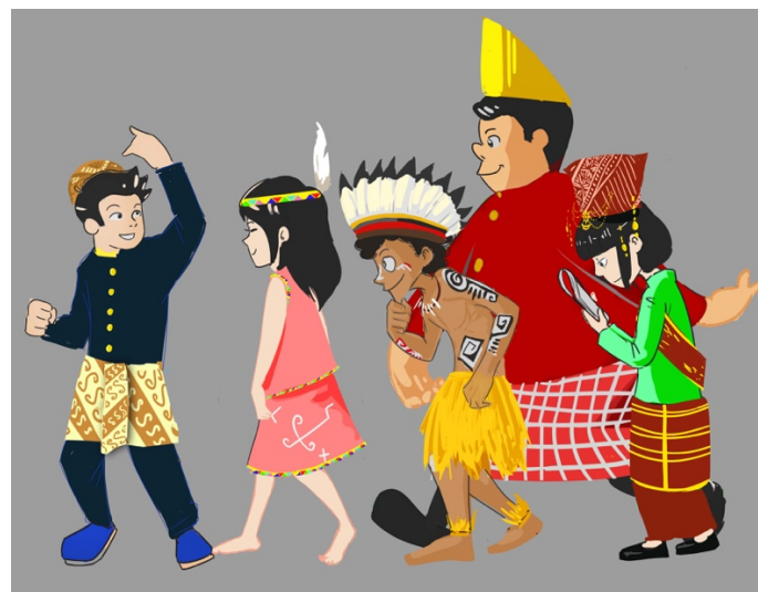
Figure 2: Pancasila snakes and ladders characters (3 male, 2 female)