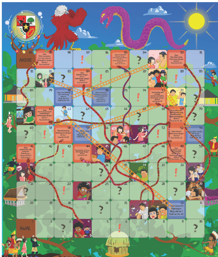
Figure 4: Pancasila snakes and ladders banner (600x700 cm)