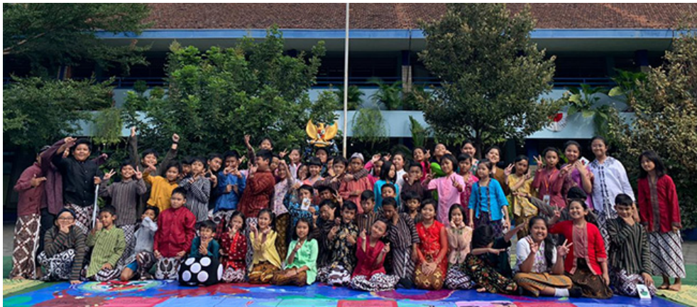
Figure 5: Pancasila snakes and ladders simulation, SD Tarakanita Bumijo, Yogyakarta, 15 Agustus 2019

elementary, junior high school, and university in Jakarta, Bali, and Yogyakarta.