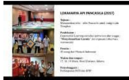
Figure 2: The Snakes and Ladders game "Save Garuda"

The subjects in this study were participants in the simulation of the Pancasila Snakes and Ladders game which was held on April 22, 2019. The research subjects were 30 students of the Creative Experiment class. Research Object is a prototype of the Pancasila Snakes and Ladders game developed from board game, final project, Randy (Faculty of Visual Communication Design of Universitas Tarumanagara student).