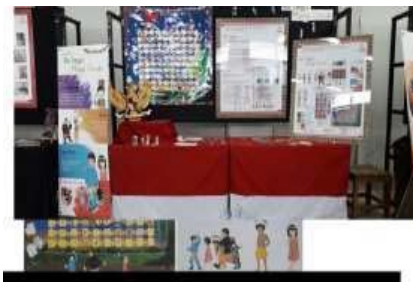
Figure 6: The design of Boardgame for Learning Pancasila