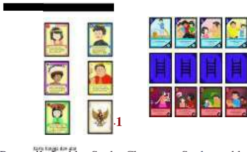
Figure 4: Pancasila Ladder Snake Character; Snake and ladder cards