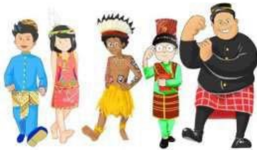
Figure 12: All characters