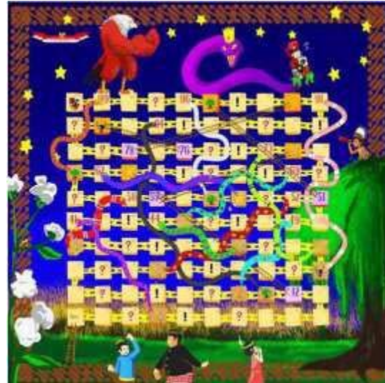
Figure 13: The final design of boardgame