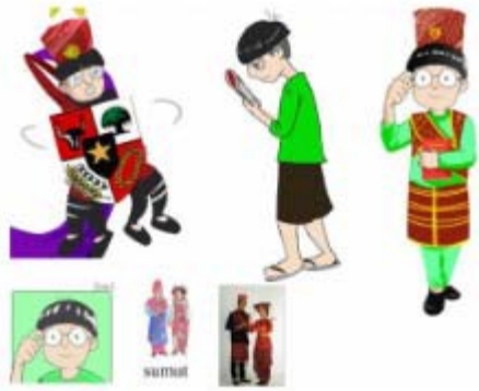
Figure 10: 4 th character design, Joni