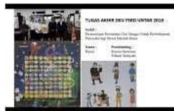
Figure 3: Final Project of DKV FSRD Untar