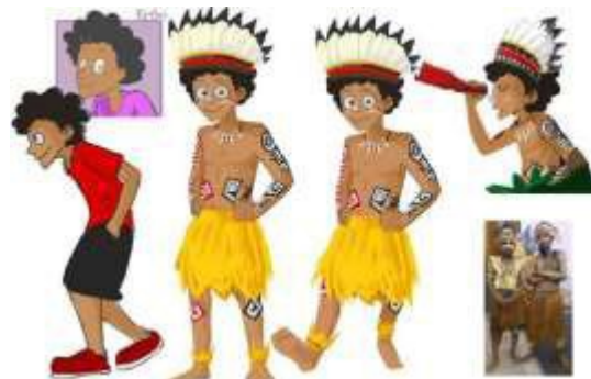
Figure 9: 3 rd character design, Kribo