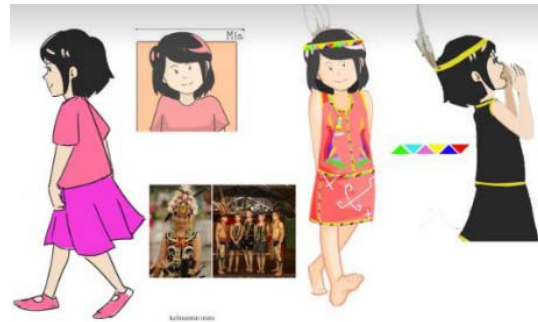
Figure 8: 2 nd character design, Mia