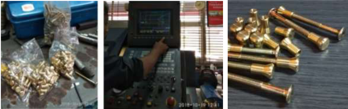
Figure 2. Manufacturing process of nuts connector product on bolts joint connector (JCB) for knock down systems on rattan furniture.