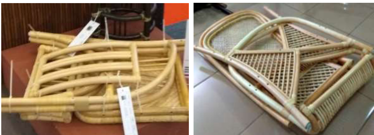
Figure 4. The final result of the knock down rattan furniture construction system for the global market

Thus it can be concluded that the knock-down construction system is one solution to overcome assembly, storage, and delivery of rattan furnitures. The knock-down construction system has practical value and efficiency, so that the capacity of the room for delivery and storage can be