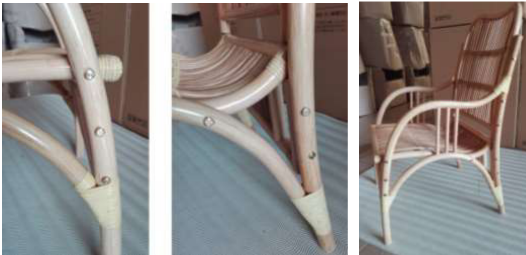
Figure 3. Application of nuts connector on bolts joint connector (JCB) in rattan chairs.