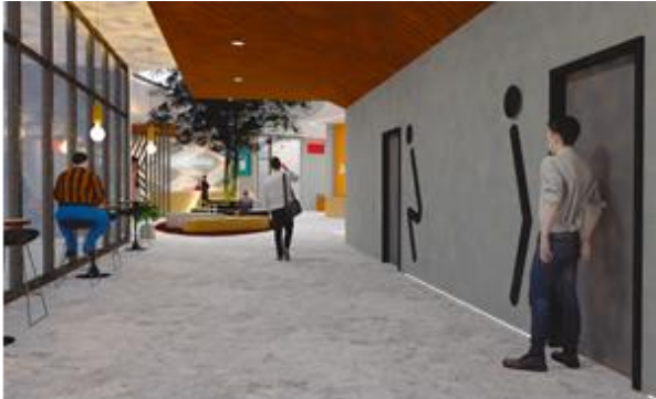
Figure 7 Corridor Lounge View

Coffee corner facilities are also provided in the lounge area with a self-service system where users and visitors can use the area. Equipped with a mini freezer, oven, and snacks. This area is directly opposite the lounge.