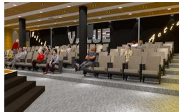
Figure 10 Seminar Room View 1

The ceiling that is displayed is a white drop ceiling in which there is a hidden lamp. This classroom displays a blackboard with a glass board and projector screen. This room, provides a cosy atmosphere.