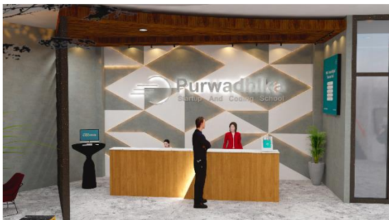
Figure 2 Receptionist View

The entrance directly faces the lobby area where there are stairs leading to the 2 nd floor. In this lobby is the centre point where there is a led screen that's displays information about Purwadhika. The impression from the lobby is dynamic and modern.