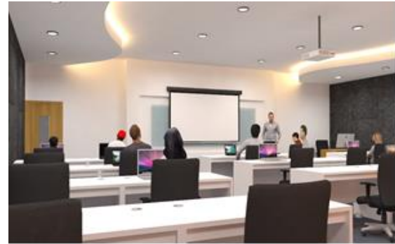
Figure 9 Classroom View 2

The classroom illustrates the impression of being simple with a touch of colour on the back to make it brighter. The back wall displays a mural of writing and a hidden lamp in warm white. Class wall display symmetrical accents with padded walls. This classroom is dominated by white to make it look clean and bright.