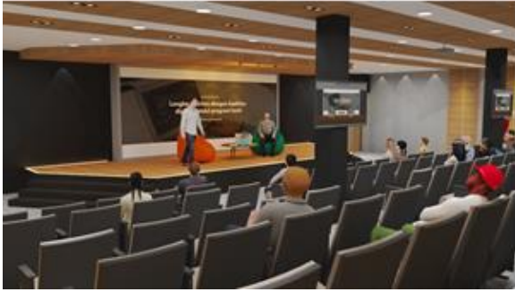
Figure 11 Seminar Room View 2

Beige auditorium chair gives the impression of simple modern. The stage area has a high level so that the seminar area welcome. An orange and green bean bag gives a refreshing and pleasing impression. On the seminar screen using a led screen that can be connected by television in the column to reach participants visions. The seminar room make a cosy and dynamic atmosphere.