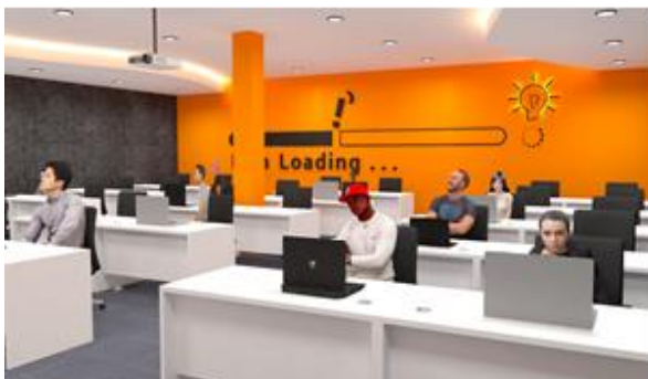
Figure 8 Classroom View 1

The corridor connects the lounge with the study area. There are chairs and tables on the left side with a window so that users and visitors can see the view outside the window. Natural lighting comes in through the window and there are hanging lamps that give the impression of being simple and cosy.