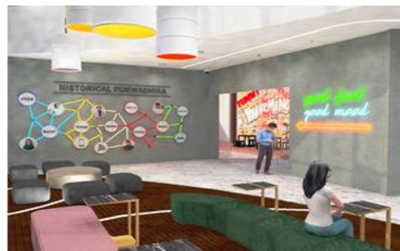
Figure 5 Lounge View 3

In this lounge area there is a bench where users and visitors can relax by doing work. This bench makes the lounge atmosphere natural and comfortable because there are plants that are on the bench.