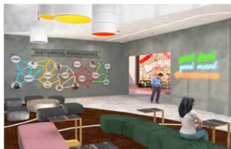
Figure 5 Lounge View 3

In this lounge area there is a bench where users and visitors can relax by doing work. This bench makes the lounge atmosphere natural and comfortable because there are plants that are on the bench.