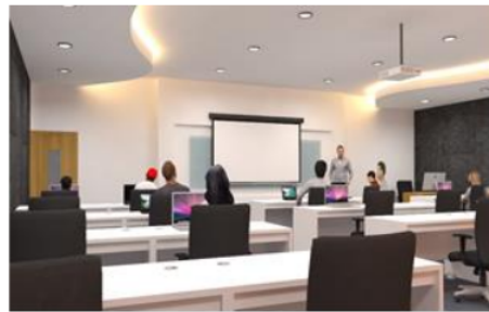
Figure 9 Classroom View 2

The classroom illustrates the impression of being simple with a touch of colour on the back to make it brighter. The back wall displays a mural of writing and a hidden lamp in warm white. Class wall display symmetrical accents with padded walls. This classroom is dominated by white to make it look clean and bright.