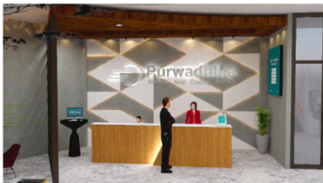
Figure 2 Receptionist View

The entrance directly faces the lobby area where there are stairs leading to the 2 nd floor. In this lobby is the centre point where there is a led screen that's displays information about Purwadhika. The impression from the lobby is dynamic and modern.