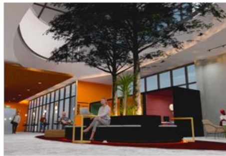
Figure 4 Lounge View 2

In the lounge area adjacent to the bright colours display a pleasant and cosy impression. Users and visitors can freely move to discuss with each other.