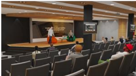
Figure 11 Seminar Room View 2

Beige auditorium chair gives the impression of simple modern. The stage area has a high level so that the seminar area welcome. An orange and green bean bag gives a refreshing and pleasing impression. On the seminar screen using a led screen that can be connected by television in the column to reach participants visions. The seminar room make a cosy and dynamic atmosphere.