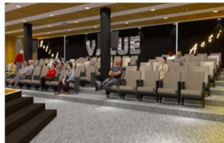
Figure 10 Seminar Room View 1

The ceiling that is displayed is a white drop ceiling in which there is a hidden lamp. This classroom displays a blackboard with a glass board and projector screen. This room, provides a cosy atmosphere.