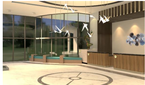
Figure 9 Perspective View 2