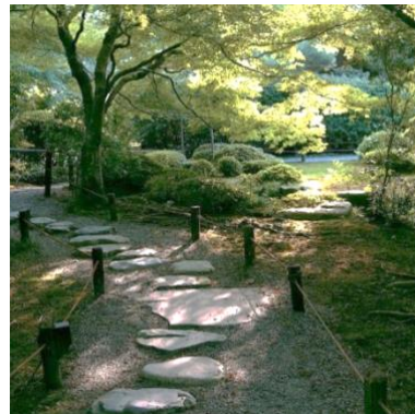
Figure 4 Garden

Gardens are wonderfully peaceful places. It is so great to stroll, feeling comfortable and welcome in the Garden—the sound of water and calm. We want our guest to feel welcomed when they arrived at the lobby of the hotel. Not only the first impression on the interior but also the experience they could get at the hotel. These are the main ideas for the interior.