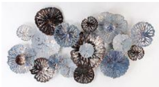
Figure 6 Metal Flower Artwork

Metal artwork will be used to make a highlight on the reception wall. The metal artwork is a new type of artwork other than paintings and pictures. The artwork will give a modern and unique feel to the interior design.