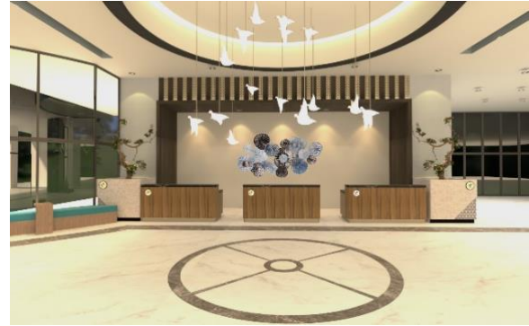
Figure 8 Perspective View 1

The materials chosen were nature inspired. Natural stones such as marbles will be used as the flooring material for the lobby area. Various types of marbles were used in the design process to enhance the look. Wood was mainly used as the room's primary material, bringing warmth and the garden feel to the room.