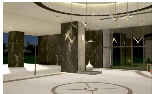
Figure 10 Perspective View 3

These are some perspective pictures of implementing the image into the interior of the Holiday Inn Express hotel's lobby.