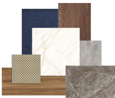
Figure 7 Material Scheme

The furniture used will use natural materials such as wood and stone. The selection of furniture is seen from comfort, function, and durability to meet the hotel's sustainability. Visitor comfort is prioritized in furniture selection. The furniture chosen is contemporary furniture that combines traditional elements with modern aspects. The guests who visit can feel the nuances of Indonesian and Modern culture to match the current trend.