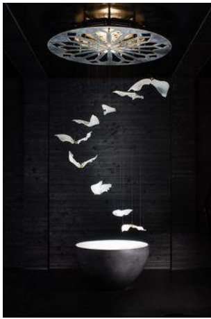
Figure 5 Hanging Lights

implementation of pigeons as hanging lights are not merely aesthetic purposes but also give the guests the extra experience they will not get at any other hotel.