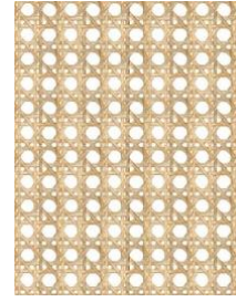
Figure 3 Material Concept

The materials used are natural materials such as wood, natural stone, rattan and water. The materials chosen are materials that can last a long time and are low maintenance and sustainable. The hospitality of IHG Green Engage from the hotel is achieved, an environmental sustainability system to protect the surrounding environment.