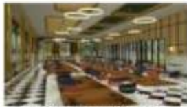
Figure 18. Color Application on All-Dry Dining Interior