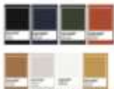
Figure 17. Color Scheme of the All-Dry Dining Room Interior