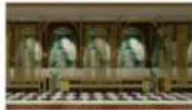
Figure 20. Application of patterns on All-Dry Dining Interior