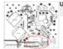
Figure 2. Location of All Day Dining Restaurant at Pullman Vimala Hills

The Pullman Vimala Hills Hotel is a Resort Hotel located on the Beach Raya Road, Lampung Gading, Bagan Waru City.