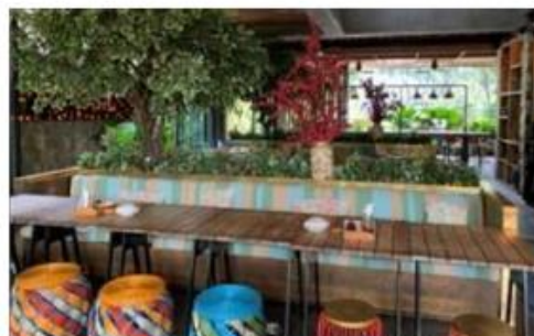
Figure 9 Indoor Dining Room (Main) 1st Floor (by Author Team, 2019)

The 1 st floor is for the toilet, kitchen and stair area to the 2 nd floor. While the upper floor functions as a multipurpose dining area that can be used for small meeting activities, discussions, and is an outdoor dining area. On the second floor the circulation of the building, the user and the air forms of the U-shape building make the air circulation is good. The void's function as air circulation from the 2 nd floor to the 1 st floor (building C). On the 2 nd floor the entire area is also surrounded by greenery so that the concept of eco-design feels that brings a natural atmosphere and on the back side there is an outdoor dining area called the rooftop dining area.