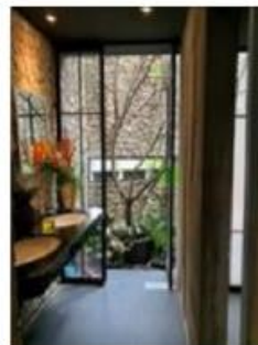
Figure 19 Ventilation System in The Toilet 1 st Floor (by Author Team, 2019)

The air temperature condition in Lemongrass restaurant is generally quite comfortable and moderate humidity level. The shade factor is supported by the large number of open areas, greening of trees and plants that produce a lot of oxygen. This high humidity factor is influenced by the location of restaurants located in urban centers on Jalan Raya Padjadjaran.