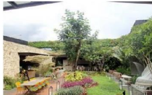
Figure 2 Middle Building of Lemongrass Restaurant (by Author Team, 2019)