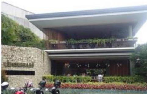
Figure 1 Front Building of Lemongrass Restaurant (by Author Team, 2019)