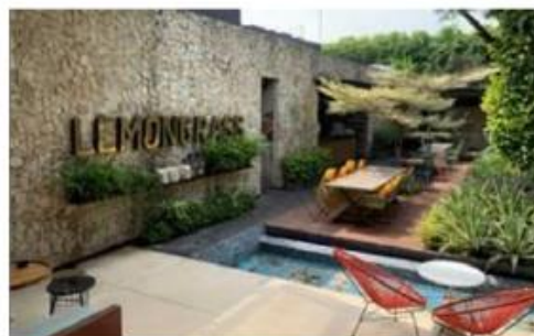
Figure 11 Al Fresco Dining Room on the 1st Floor (by Author Team, 2019)

Located on the back side of the building C, this dining area is referred to as Al Fresco which in general terms refers to dining together outdoors and an open-air atmosphere [6]. The phrase "Al Fresco" is taken from the Italian language which means cool air. The Al Fresco dining area spoils the eyes of visitors with an open area that provides freshness. One of the unique elements in this area is its reflective water pond which shows the shadows and mosaics formed at the bottom of the pond.