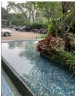
Figure 4 Water, Nature and Environment (by Author Team, 2019)

The restaurant building is surrounded by plants and greenery. There is a pool of water to support the concept of a tropical garden from the concept of architecture [5]. The material used gives an accent to the concept of green and eco-tropical. The parking area uses a brick block that has a high-water absorption (Figure 3). In order to form a unity with the environment, designed a small pool of water for artistic elements and tranquility [8].