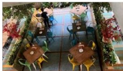
Figure 15 Natural Lighting in Dining Area 1 st Floor (by Author Team, 2019)

The lighting in this restaurant is designed with the aim of conserving energy by optimizing natural lighting during the day with advantages of the U-shape building. The dining room on the 1 st floor in the middle has a void connected to the 2 nd floor so that it provides the advantage of getting natural light. The outdoor dining area which is on the front and middle side get enough natural light directly [10].