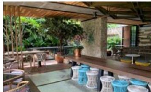
Figure 14 Material Selection of Furnitures (by Author Team, 2019)

ironwood material on tables and chairs combined with rattan and iron construction. Chairs and tables in this restaurant aren't uniform in shape and color but produces as its own uniqueness.