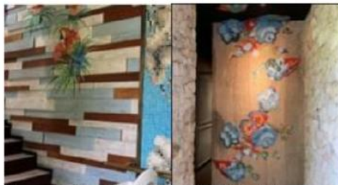
Figure 12 Material selection of Wall (by Author Team, 2019)

The concept of material in this restaurant has started to apply the principle of reuse and recycle [9]. The principle of reuse in the 1 st and 2 nd floor area is implemented with the use of materials that have undergone a process of recycling and accessories with the concept of 'antiquity' such as: the use of mirrors, old-fashioned artwork accessories, on walls and floors made of natural stone material such as clam shells as material floor with a rough surface that again shows aspects of the tropical concept. Some plants in the dining indoor area are mixed between original and artificial plants. On the wall area near the toilet and stairs using a partition of used wood which is then finished again by painting murals with paint media.