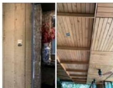
Figure 20 Recycled Wood and Exposed Concrete (by Author Team, 2019)

The application of this principle is oriented to this restaurant by using materials that minimize all negative impacts for the environment. Some parts of the decoration elements that use wood materials are left as is or without finishing [10]. Likewise, element walls and columns in the hallway, doors, partitions and furniture without paint finishing. It is called finishing exposed concrete. Recycled wood is also installed without the use of chemicals.