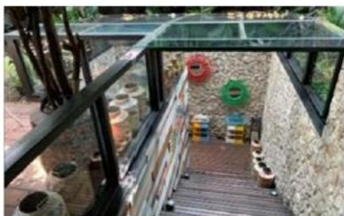
Figure 17 Natural Lighting with the 'Skylights' from Glass Roof Construction (by Author Team, 2019)

For the 1 st and 2 nd floor during the day reduce usage of artificial lighting. The artificial lighting in the form of led spotlight is only as accentuation in the room to provide atmosphere of warmth and comfort. Lighting in the pantry and dining area also uses an indirect lighting system that produces soft and warm lighting to enhance the comfort of guests [10]. The connecting stairs from the 1 st to the 2 nd floor also have a glass roof for natural lighting.