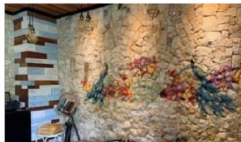
Figure 16 Artificial Spotlight Led Lighting for Wall Accents (by Author Team, 2019)