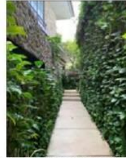
Figure 6 Entrance to the Lemongrass Restaurant

The facade of this restaurant building looks like a minimalist house building with a small pool and garden in front of it (Figure 4 and Figure 5). The entrance into the restaurant through the road like a corridor / alley that is on the left and right side planted with green leaves creeping surrounded by rocky walls (Figure 6) [8].