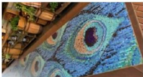
Figure 13 Material selection of Floor 'Tropical Concept' (by Author Team, 2019)

The principle of reduce is also implemented in restaurants using pallets and recycled wood on walls and floors. The wall on the second floor is dominated by cream-colored natural stones combined with recycled wood as an accent. On the ceiling, it is given a natural impression as possible with exposed concrete material and iconic recycled plywood wood as the ceiling [10]. There is the use of