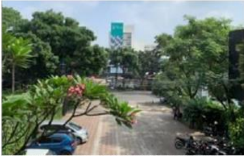
Figure 3 Lemongrass Restaurant Parking Area

The restaurant building is surrounded by plants and greenery. There is a pool of water to support the concept of a tropical garden from the concept of architecture [5]. The material used gives an accent to the concept of green and eco-tropical. The parking area uses a brick block that has a high-water absorption (Figure 3). In order to form a unity with the environment, designed a small pool of water for artistic elements and tranquility [8].