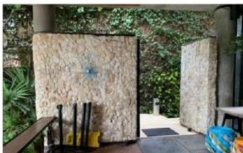
Figure 18 Open Area in 1 st Floor (by Author Team, 2019)

Vulnerability extends to natural ventilation, this is implemented in the form of building A and building B which use U-shape, with the building C have void in the middle on the 2 nd floor make circle circulation in this restaurant (Figure 7 and Figure 8). Sides of Building B also have natural ventilation (Figure 20). Building construction with many openings and open hallways. The material used and the surrounding plants also support the cool air in this restaurant [3].