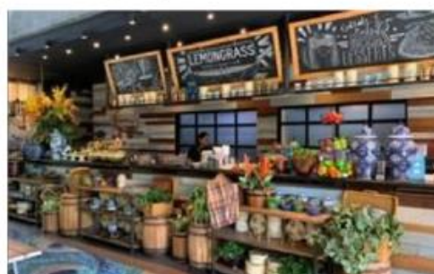
Figure 10 Pantry and Kitchen on the 1st Floor (by Author Team, 2019)