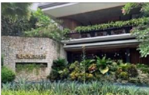
Figure 5 Facade of Lemongrass Restaurant Building (by Author Team, 2019)