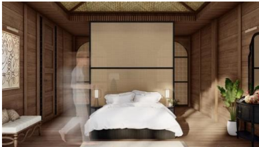
Figure 17 Perspective 1 Bedroom Area (Celine Rei, 2021)