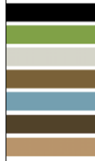
Figure 9 Color Scheme (Celine Rei, 2021)