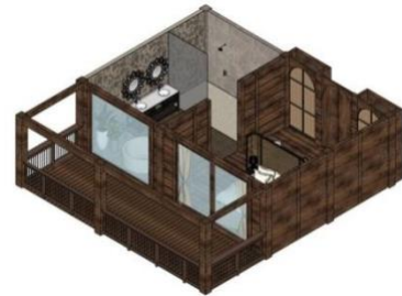
Figure 22 Axonometry Villa Standard Bedroom (Celine Rei, 2021)