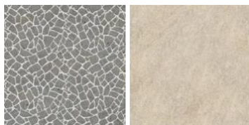
Figure 11 Bedroom and Bathroom wall material (Celine Rei, 2021)

A wall is a vertical plane that is used as a barrier between spaces and has different processing purposes [9]. In the bedroom area, the material applied still uses wood in order to create a good space visual flow from the ground up. Meanwhile, the bathroom area uses natural stone materials that are combined with beige coloured marble to neutralize the overall room tone.