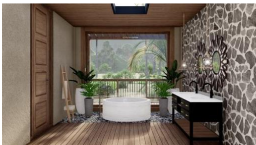
Figure 19 Perspective Bathroom Area (Celine Rei, 2021)