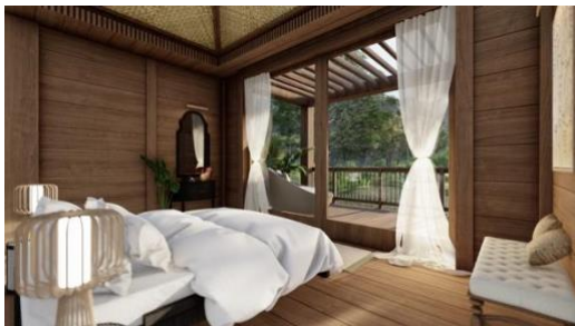
Figure 18 Perspective 2 Bedroom Area (Celine Rei, 2021)