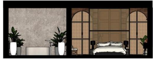
Figure 20 Section Bedroom and Bathroom Area (Celine Rei, 2021)