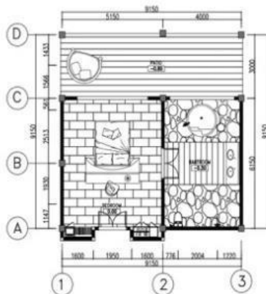
Figure 7 Layout Plan Villa Standard Bedroom (Celine Rei, 2021)

The layout concept in this space is focused on the direction of the view of the room that leads directly to mountain scenery which is also part of the adjustments to the overall theme “Part of Nature”. The spatial arrangement is transparent or open with the use of large glasses to allow guests to enjoy the beautiful views that are present in the area.