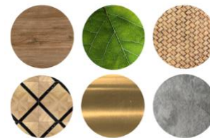
Figure 8 Material scheme (Celine Rei, 2021)

The character and style used in this design is natural by using natural elements that are applied in furniture such as rattan, bamboo and wood. In accordance with the design image, the atmosphere applied in the space is an open, comfortable, warm and relaxing area.