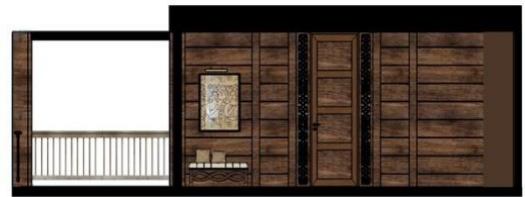
Figure 21 Section Bedroom Area (Celine Rei, 2021)