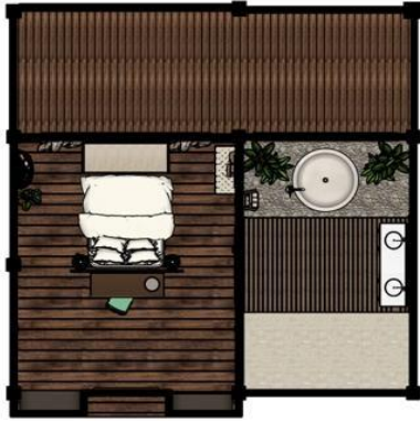
Figure 16 Layout Villa Standard Bedroom (Celine Rei, 2021)