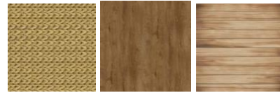
Figure 12 Bedroom and Bathroom ceiling material (Celine Rei, 2021)

Bathroom ceiling is covered with wood decking and tempered glass ceiling to allow light to pass through into the area.