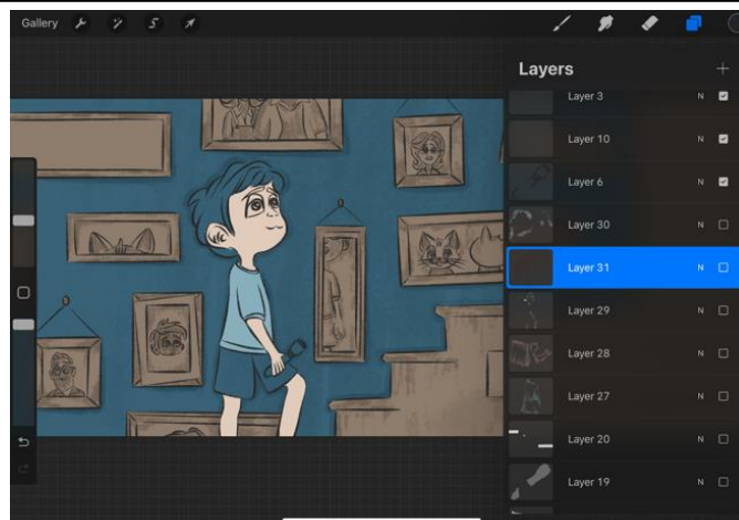
Figure 4. Illustration Process with Procreate