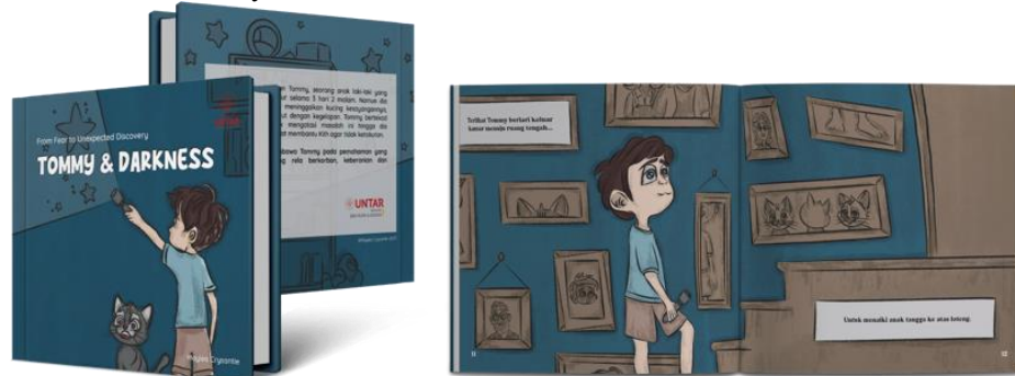
Figure 6. "Tommy & Darkness" Children's Book Display

The results of this evaluation ensure that the book not only conveys the moral message effectively but is also able to attract the attention and interest of young readers through attractive illustrations that match the story.