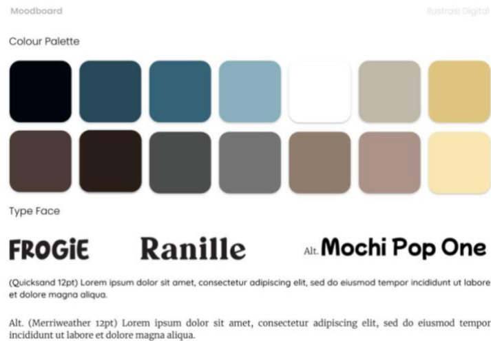
Figure 1. Script & Mood Board Preparation