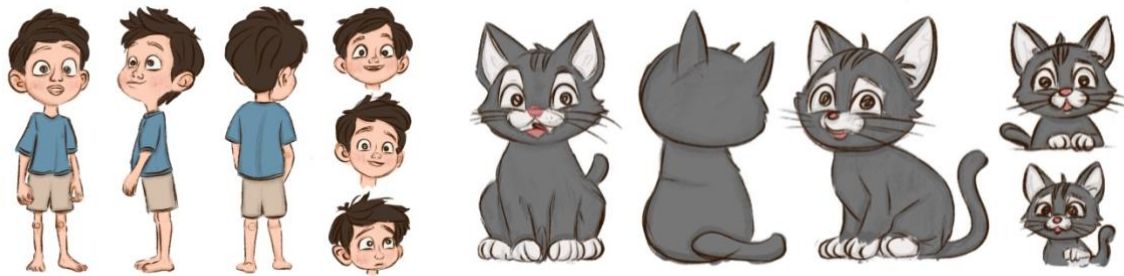
Figure 2. Tommy and Kith Character Depiction (Source: Crysantie, 2024)

The illustration style used is expressive by utilizing facial lines, bright colors, and large eyes to clearly show the emotions and feelings of the characters.