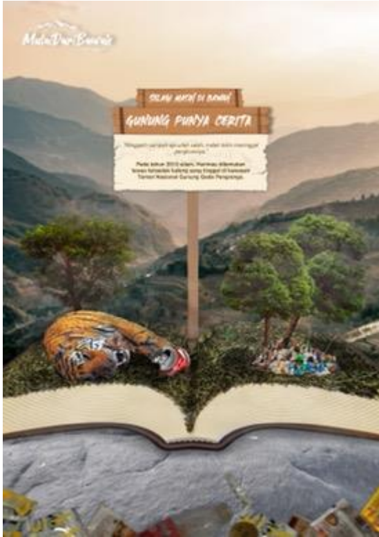
Figure 5 Third key visual the story of death animal

Behind these key visuals, there was a comprehensive creative strategy. Starting from obtained insight from several interviews, “It’s just a small litter, wouldn’t even become a thing if I throw it here. From the underestimated small litter, becoming big problem later”. That insight came from several targets whose littering because they think it won’t be much problem, when the reality, it actually does. Departing from the insight, the author came with a big idea, “It starts from the small things”. Small things may refer to small litter that hikers threw away that causing big problems in another day, or small and basic steps which hikers should know about anticipating and managing their litters.