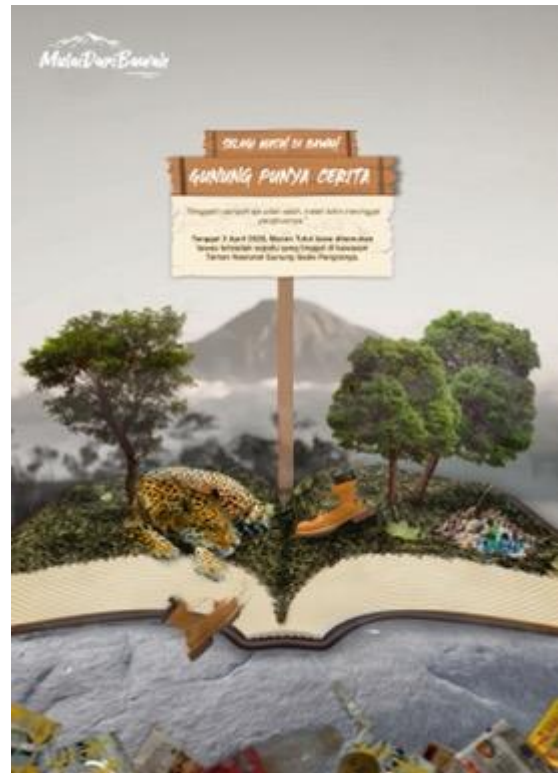
Figure 4: second key visual speak another problem