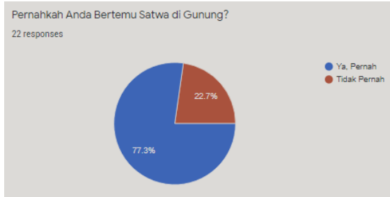
Figure 2 The appearance of animals when climbing is increasingly intense

could mean a good thing or a bad thing because of the possibility of human activity that pushed animals into the hiking trail. An encounter with wild animal, especially predator, usually doesn't end up well, for human or the predator itself. So, an encounter should be evaded as much as possible.