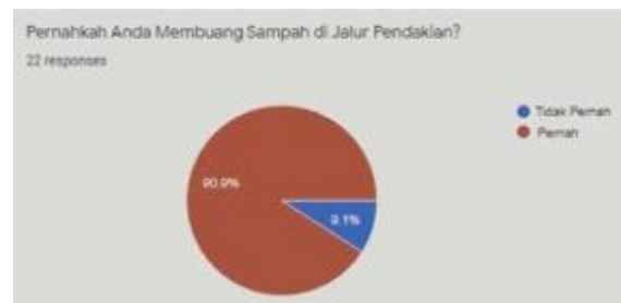
Figure 1 First questionnaire

Based on questionnaire data, 77.3% of hikers encountered animals on the mountain, and 22.7% haven’t. In this case, it