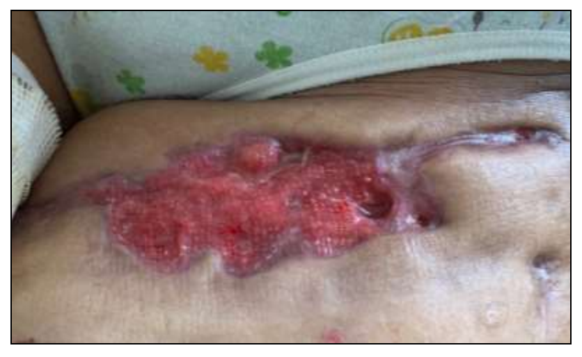
Fig 6: Fifty days after the intervention