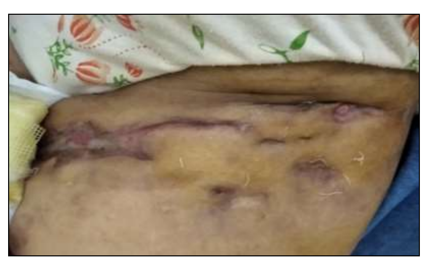
Fig 7: One month later, the patient came to control. The wound has closed and was accompanied by scarring