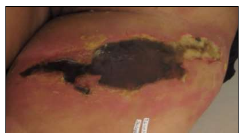
Fig 1: A necrotic ulcer covered with black eschar, measuring 17x7 cm, with a hyperemic edge

days after the intervention, the formation of granulation tissue has appeared (fig. 4). Two weeks later, the lesion has got smaller in size, and granulation tissue was perfectly formed (fig. 5). The lesion had been getting better since then (fig.6), and one month later, it became a closed wound accompanied by scarring (fig. 7). The patient was very satisfied with the result.