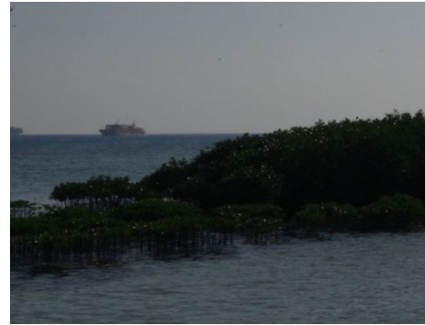
B: Travel to explore the Mangrove Forest with a Canoe