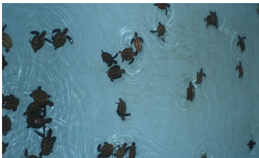
C: Hawksbill Breeding