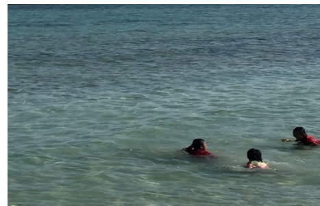
D: Seawater play (Swimming)