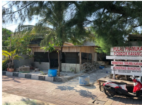
A: Pondok Karang and Mangrove community involvement forum for conservation

hr a day, and have reached every house on Pramuka Island, while for lodging, hotels and homes for tourists to stay are available.(Figure 3).