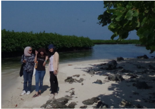
A: Hawksbill Release Area