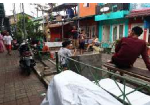
Figure 4. Community gathering activities in Kampung Deret Petogogan park (above and below)

Furthermore, the determination of the benefits in a public space is also influenced by the relationship between the elements that make up the space, such as infrastructure and human activities (Effendi, Waani, and Sembel 2017). Play facilities, seating, green trees in pots, or directly on the land used by residents were used as a quality measure. Physical aspects as indicators of quality and benefits, include the dimensions of open space, the infrastructure in it, its shape, and location (Amin 2018). According to the observations, the existence of a park which is also green open space has less than optimal quality, as shown in figure 4.