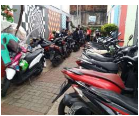
Figure 6. Community activities on Kampung Deret Petogogan road as a gathering place (above) and motorcycle parking (below)

Due to the open space quality which is estimated to be inadequate, people using it also have space for interaction between residents, however, only sit around without supporting elements. The role of government and population response is needed to provide more comfort, and does not rule out the function of roads for circulation. Meanwhile, based on the spatial use aspect (meaningful space), the neighborhood roads are based on favorable observations. It is also a part of the circulation in this area, coupled with other functions that are very meaningful to its residents. The aspects of quality indicators have been fulfilled in terms of its usefulness, and the non-physical aspect shows the current public open space benefits in Kampung Deret