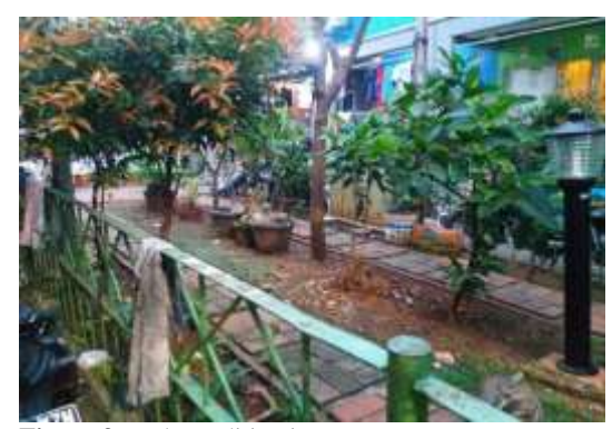
Figure 3. Park condition in Kampung Deret Petogogan

space in the research area is in the middle of a residential area.