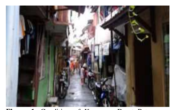
Figure 1. Condition of Kampung Deret Petogogan 2013

In terms of improving the development and services offered to the community, Jakarta Government has held several useful programs for the city's progress, which cover many aspects, such as a settlement arrangement. Furthermore, their targets include rejuvenating slum areas and intact residential neighborhoods. There are many approaches and programs provided in addressing these problems, such as the improvement of direct physical targets (houses), repair of infrastructure, and socio-economic services (Aditantri and Jamila 2019). For infrastructural improvement, usually, the Government make attempt to build and develop the physicals in the field (Machmud 2015), and also applying the social approach in establishing the community's elements. One of these programs is the Kampung Deret Petogogan (figure 1).