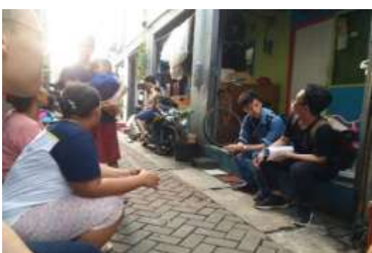
Figure 5. Community activities on Kampung Deret Petogogan road as a selling place (above) and gathering (below)

In this area, democratic nature is felt when people gather and socialize (figure 6 above), and are compromised as parking lots for motorbikes (figure 6 below). However, from the view of use, the road should be used for pedestrian or vehicle circulation, because it is capable of causing chaos, due to the irregularities in the functioning of the open space. Therefore, the road becomes narrow due to the congregation and circulation of the residents, which is hampered by both humans and vehicles.