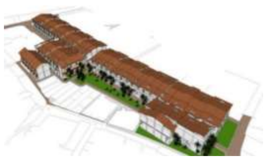
Figure 2. Plans at the location of Kampung Deret Petogogan Source: Slum Settlement Arrangement with RISHA Technology in Petogogan area, South Jakarta (Pramantha 2019)

structural technology RISHA (Rumah Instan Sederhana/Simple Instant House) in its material applications (Sabaruddin and Sukmana 2015).