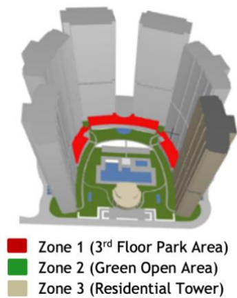
Figure 1. Taman Anggrek Residence zoning.

The application of biophilic design can be applied in various aspects of architectural design. In this study, it was identified that the concept of biophilic design prioritizes the incorporation of natural elements from the outdoor space and integrating them into the indoor space. Based on Figure 1 , indoor spaces that are directly connected to the outside space, both through openings and directly exposed, are located in zone one (1) and zone two (2) located on the lower floor, as well as category one (1) in zone three (3) which is a residential tower with the characteristics of a space located on the lower floor.