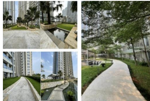
Figure 2. Apartment Taman Anggrek Residence.

in design ( Browning, Ryan and Clancy, 2014 ; Hady, 2021 ). These points are the visual and non-visual relationship with nature, the regulation of temperature and air flow in the room or building, the presence of water elements in the design, lighting settings, and the relationship between the building and the natural system ( Paradise, 2015 ).