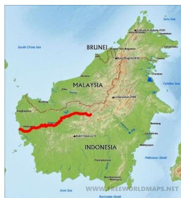
Figure 1. Kapuas River in West Kalimantan, Indonesia

The Kapuas River is located on the province of West Kalimantan, Indonesia, as shown in Figure 1. Kapuas River is a river with a high level of sedimentation thus attracting researchers around the world to study its special feature. Several spots on the Kapuas River have experienced sedimentation. Sedimentation time is one of the factors affecting sedimentation process where estimation of effective deposition time can be calculated. Sediment settling velocity is influenced by several factors, one of which is the amount or concentration of sediment.