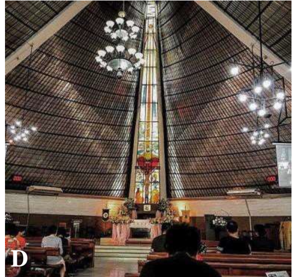
(A) Location of Kristoforus Church; (B) The outside view of Kristoforus Church; (C) The interior of Kristoforus Church; (D) Natural lighting in altar.