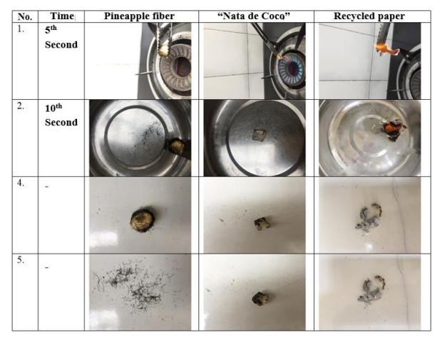
Table 4 Roasting Process

The findings on the roasting process using blue-orange fire with a temperature of 1000-1500 degrees Celsius to produce the following references: