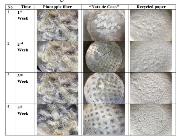
Table 7 Preserving Process

The findings on preserving lime powder ( CaCO_3 ) dissolved in H_2O (aqua, PH: 7) refer to the following: