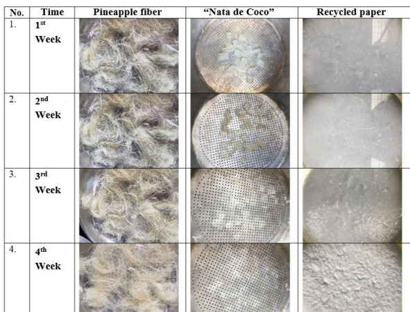
Table 5 Drying Process

The findings in the form of the drying process in the form of direct exposure to sunlight for 30 days in tropical Jakarta temperatures vary from 22 degrees Celsius to 38 degrees referring to: