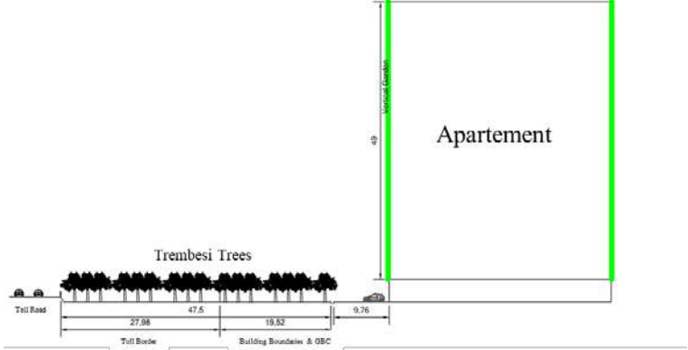
Figure 1. Greensite Concept

can be reduced according to studies [3] is 59.22%. Total additional costs incurred for developing green sites are Rp. 700,000., Per tamarind tree seedlings plus Rp. 1,700,000., For vertical gardens per unit. the total cost required for Greensite is ± Rp. 17,000,000,000.