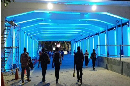
Figure 7 Underpass

underground pedestrian space must be connected to the underground pedestrian crossing. At night, crossings under the road must be provided with adequate lighting.