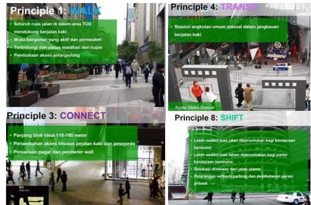
Figure 2 Four principles from ITDP

This research study is the accessibility of pedestrian paths in the corridor of Jl. Teluk Betung 1, starting from Thamrin City to BNI City station, focused only on the four principles of this ITDP, namely walk, connect, transit, shift.