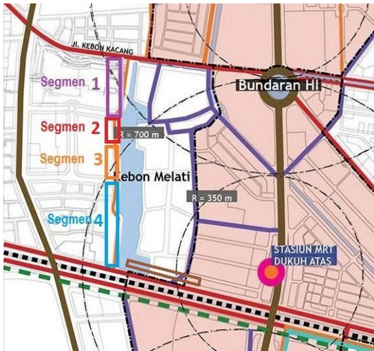
Figure 9 Segment Division