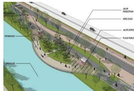
Figure 4 Riverbank