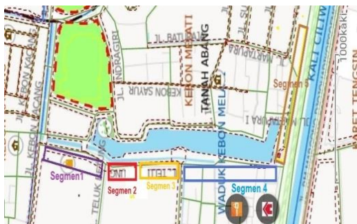
Figure 10 Map of segment 1-5

SEGMENT 5. Jl. Talang Betutu Ujung, the pedestrian path to BNI City Station, still has to go through the vehicle road. In segment 5, the integration of the pedestrian path with the transportation system has not yet been realized. In Segment 4 and Segment 5, it is necessary to plan a pedestrian path to reach the BNI City Station transit hub.