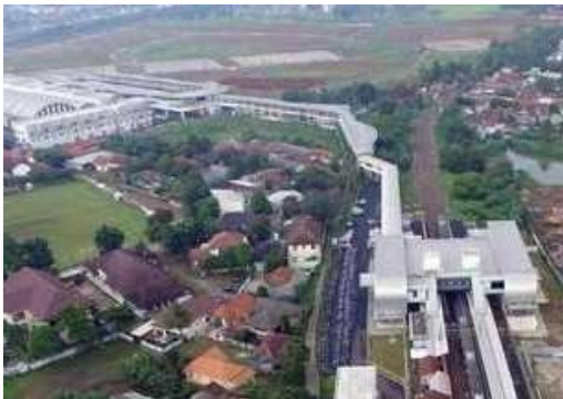
Figure 8 Skybridge.

According to Hamid Shirvani (1985), it is necessary to consider the following [11].