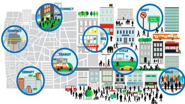
Figure 1 8-principles from ITDP [3]

The Institute for Transportation and Development Policy or ITDP mentions eight principles in urban transportation that align with the objectives of the application of the TOD concept: walk, cycle, connect, transit, mix, density, compact, and shift.