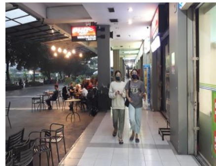
Figure 5 Arcade