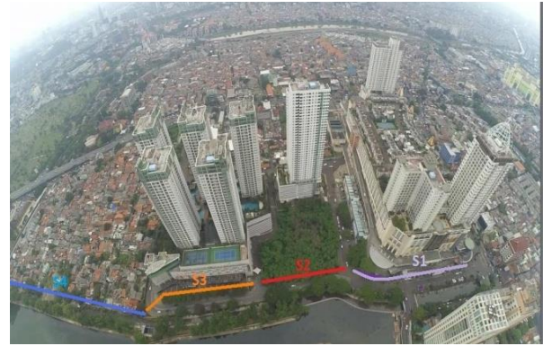
Figure 11 Aerial view segment 1- Thamrin Terrace up to Segment 4-Waduk Melati