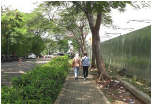
Figure 3 Sidewalk