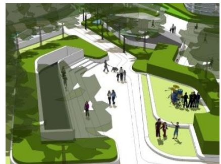
Figure 6 Pathway in green open space.