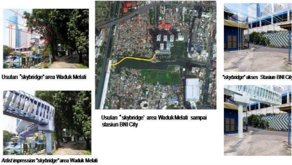
Figure 12 Design simulation.