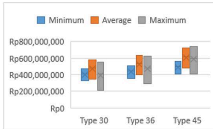
Figure 3. Estimated selling price of houses in Surabaya based on land area.

The following is the price range of residential buildings based on land area.