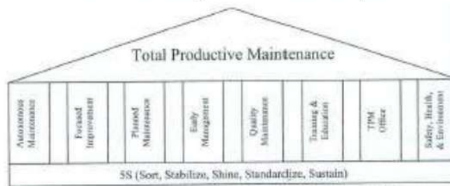
Figure-1 Building 8 main pillars in implementation of TPM

Other objectives of the TPM are zero accident and zero pollution. Clean work environment is necessary to have a safe workplace.