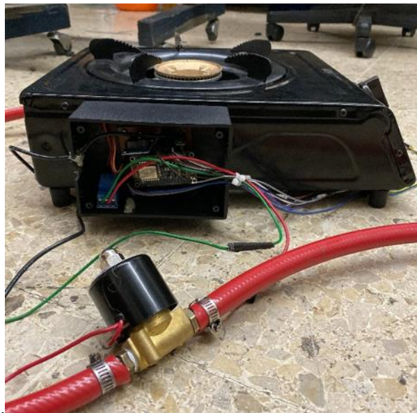
Figure 3. Realized overall system

Testing the whole system was done by connecting all existing modules. The system power supply was used as a voltage source to power the entire module that was designed in the system. The gas sensor module, the PIR sensor module, the timer module and the gas solenoid valve were all connected to the NodeMCU.