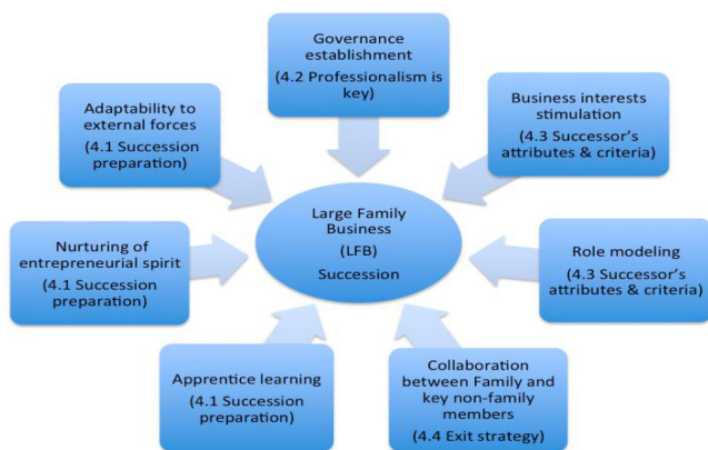
Figure 3: A Learning Framework for Large Family Business (LFB) Succession

The scant access to the incumbents in this study fosters invaluable and enriching data to be collected. Further inclusion of successors’ perspectives in future studies could demonstrate the socioemotional aspects that might be embraced by the incumbents, especially in the scenarios when no successor is willing to step in. Furthermore, the