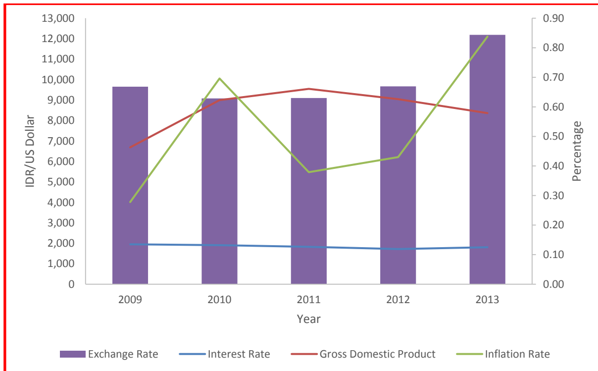
Figure 1. Description Trends of Macro Economic Indicators

Figure 1 shows that over the period 2009 to 2013 the interest rate of national private banks decreased, from 15.51% in 2009 to 11.88% in 2012, and increased again to 12.51% in 2013. GDP growth of 4.8% in 2009 pushed up to 6.61% in 2011. However, for the past two years, the Gross Domestic Product has decreased to 6.26% in 2012 and in 2013 it fell again to 5.79%. Changes to the IDR against the US dollar during the observation period is also a portrait of fluctuation, which in 2010 IDR strengthened compared to the previous period, and in 2011 through 2013 IDR depreciated where the IDR dropped from IDR9.100/US in 2011 to IDR9.670/US in 2012 and eventually reached IDR12.189/US in 2013.