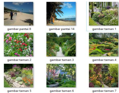
Figure 8. Cluster 2 beach -garden

We are able to see that the images between beach and garden can be clustered in figure 7 & figure 8. The formed cluster have a high precision of 98%, although there are some outlier that can be found in the formed cluster. In the formed cluster member of cluster-1 is 98 images of beach and 2 images of garden, member of cluster-2 is 98 images of garden and 2 images of beach. The images that become outlier placed in wrong cluster because the characteristic of the images more similar with the center of the cluster that images placed than the center of the cluster that the images should. With genetic algorithm the centroid that selected can be more optimum in each iteration because in genetic algorithm the best centroid will selected and combined in each process of iteration. Based on this test we can say that genetic algorithm can be use as alternative way to cluster a complex images although there is some outlier in the formed cluster.