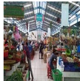
Figure 4. Traditional Market images

The images color value taken using RGB of each pixel in the image. The texture value taken using GLCM feature. The images value later used to become the population in genetic algorithm