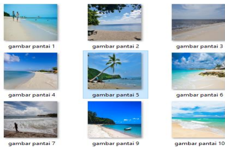
Figure 7. Cluster 1 beach-garden