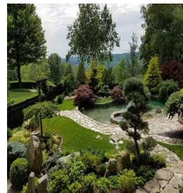
Figure 3. Garden image