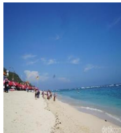
Figure 2. Beach image