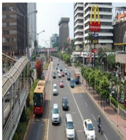
Figure 1. City image

Object that used in this paper is 100 images of beach, 100 images of garden, 100 images of traditional market, 100 images of city. These images is selected because each images have a different characteristics, e.g., beach images have ocean surface and sand surface on it, city images have road and skyscrapers on it, traditional market images have lot of vegetables and people on it and garden images have plant and footpath on it. Example of these images can be seen in figure 1 ,figure 2, figure 3 and figure 4.