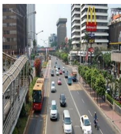
Figure 1. City image

Object that used in this paper is 100 images of beach, 100 images of garden, 100 images of traditional market, 100 images of city. These images is selected because each images have a different characteristics, e.g., beach images have ocean surface and sand surface on it, city images have road and skyscrapers on it, traditional market images have lot of vegetables and people on it and garden images have plant and footpath on it. Example of these images can be seen in figure 1 ,figure 2, figure 3 and figure 4.