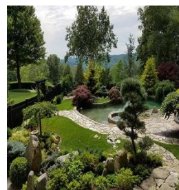
Figure 3. Garden image