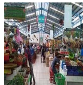
Figure 4. Traditional Market images

The images color value taken using RGB of each pixel in the image. The texture value taken using GLCM feature. The images value later used to become the population in genetic algorithm