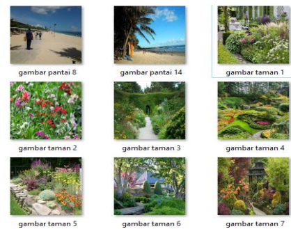
Figure 8. Cluster 2 beach -garden

We are able to see that the images between beach and garden can be clustered in figure 7 & figure 8. The formed cluster have a high precision of 98%, although there are some outlier that can be found in the formed cluster. In the formed cluster member of cluster-1 is 98 images of beach and 2 images of garden, member of cluster-2 is 98 images of garden and 2 images of beach. The images that become outlier placed in wrong cluster because the characteristic of the images more similar with the center of the cluster that images placed than the center of the cluster that the images should. With genetic algorithm the centroid that selected can be more optimum in each iteration because in genetic algorithm the best centroid will selected and combined in each process of iteration. Based on this test we can say that genetic algorithm can be use as alternative way to cluster a complex images although there is some outlier in the formed cluster.