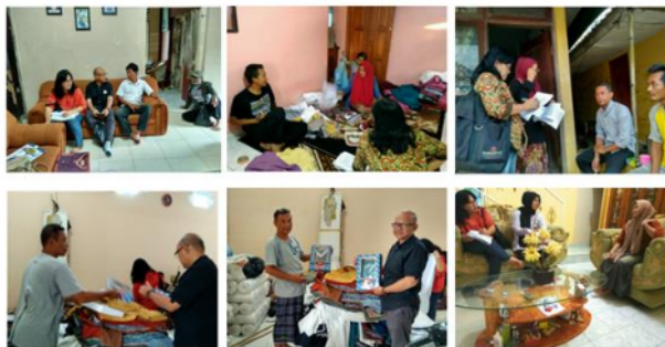
Figure.1 Description of Respondents

The population consists of entrepreneurs & makloon embroidery in the District. Tasikmalaya. The technique of selecting the sample using purposive sampling with the following considerations are: (1) The selected sample is entrepreneur embroidery or makloon with assets and sales turnover refers to UU UKM No 20 th 2008. (2) Have opportunity / plan to apply for investment credit, grant, / DN, get help tool / machine / softloan. Number of samples 50 embroidery SMEs and 50 makloons. The description of research respondents as follows: