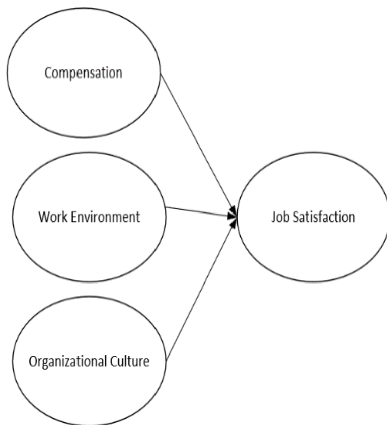
Figure 1. Research Model

determination (R-square) and predictive relevance (Q-square) were tested to test the structural model. Meanwhile, path analysis (path coefficients), effect size (f-square), and significance test (t-test and p-value) were performed to test the research hypothesis. Model of the research is as follows: